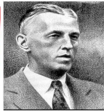
Bill Wilson AA Co-founder

RARELY have we seen a person fail who has thoroughly followed our path.