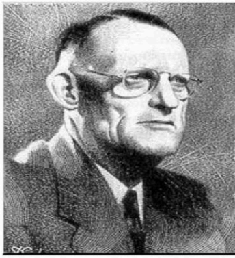
Dr Robert Smith AA Co-founder